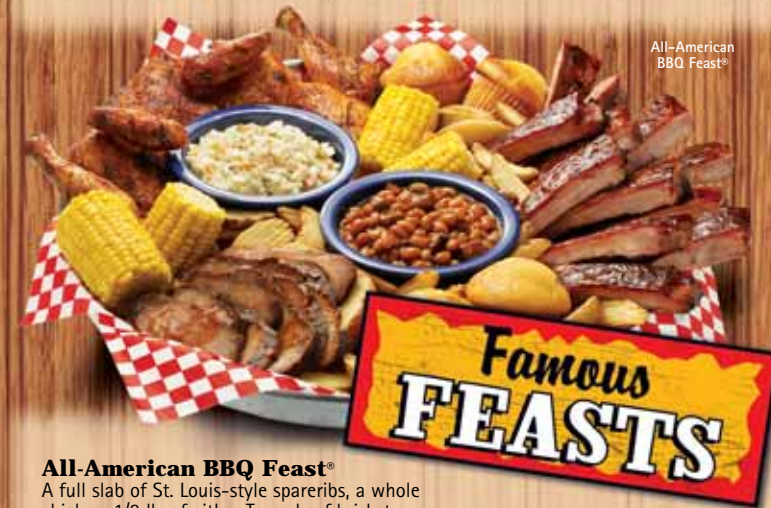
All-American BBQ Feast®

Lemon-pepper marinated half-chicken, roasted till it's fall-off-the-bone tender and char-grilled. 11.59