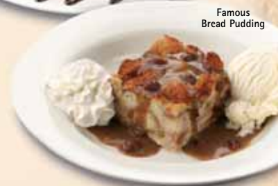
Famous Bread Pudding