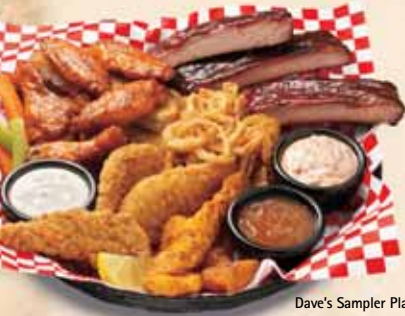
Dave's Sampler Platter

Served with a side of our Sweet Soul Jalapeño dipping sauce. 7.99